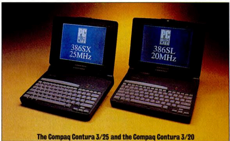
The Compaq Contura 3/25 and the Compaq Contura 3/20

The documentation is complete, but not the most straightforward we've seen. Some Contura 3/25s come bundled with Windows 3.1 and PFS:WindowWorks.